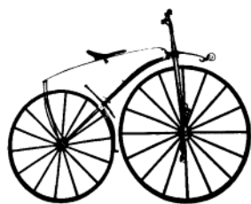
Two Wheel Velocipede