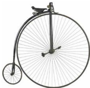
High Wheel Bike