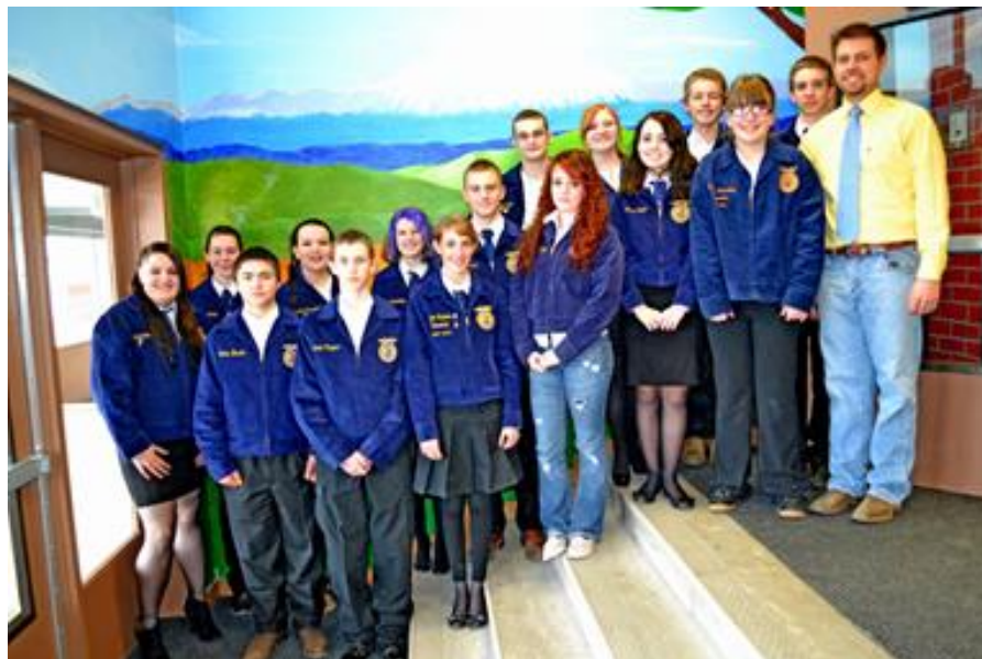
2013-2014 FFA Chapter

This has been a successful year for the Sherman County FFA Chapter.