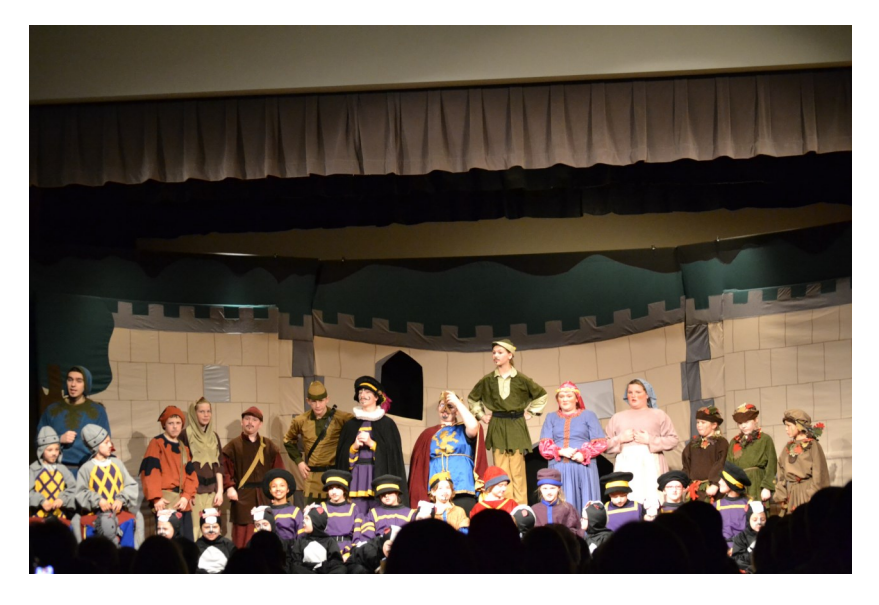
The entire cast.