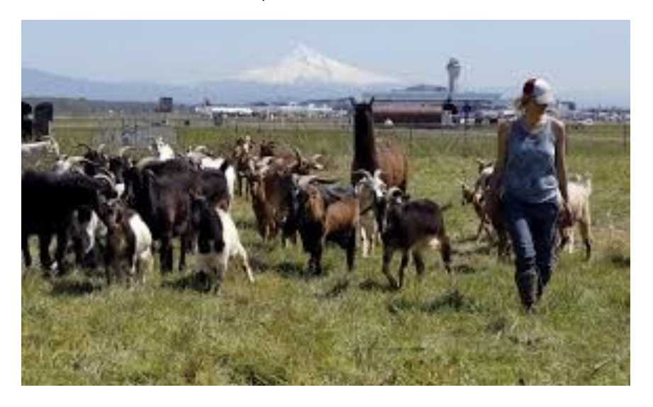
Monty the llama and his goat herd at work.