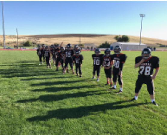
ELEM/ MIDDLE SCHOOL FOOTBALL

The Elem/ M.S. football team has been learning an entirely new defensive and offensive strategy.