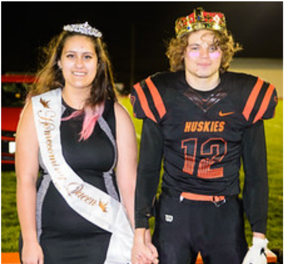
Queen Sierra King Reese