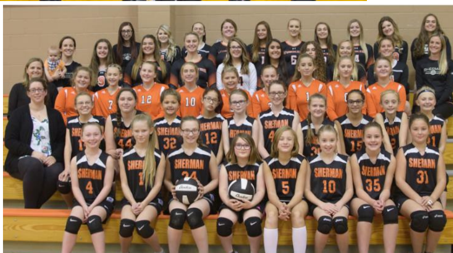
Middle School through High School Participants for 2018: Front rows, Middle School C and B teams; Orange Row Middle School A team; Top rows, High School JV and Varsity.

A Team finished 2-5 with wins against Dufur and the their home finale over St. Mary's, the latter avenging a loss suffered on the road. B Team finished the month 5-2, also defeating St. Mary's in the home finale to avenge its earlier road loss there. C Team finished 1-6 with a finale straight-sets sweep of St. Mary's.