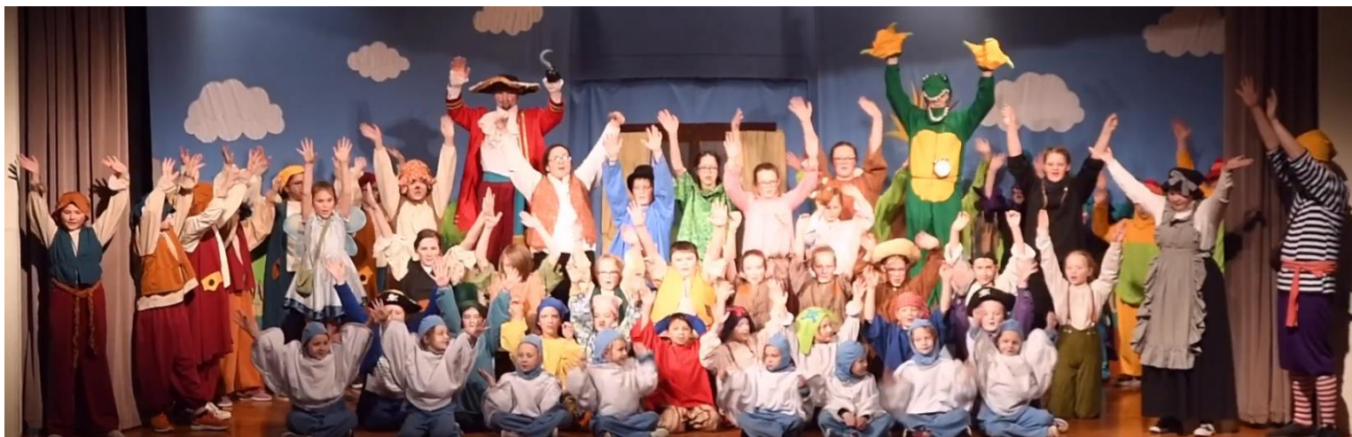
Above is the finale of Peter and Wendy from the Friday night performance, March 15. For story and further pictures, see page 6.