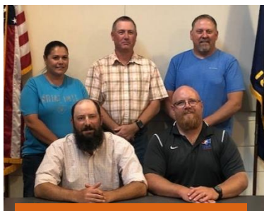
Sherman School Board

Sherman County School District 65912 High School Loop Moro, OR 97039 541-565-3500