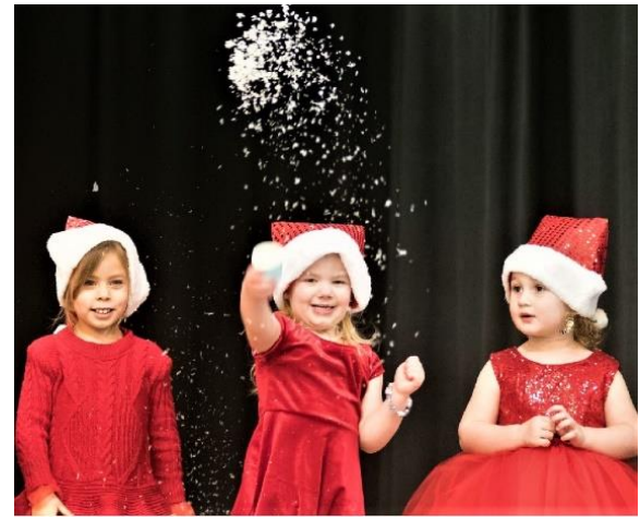
Pre-K Photos Courtesy of Jeremy Lanthorn